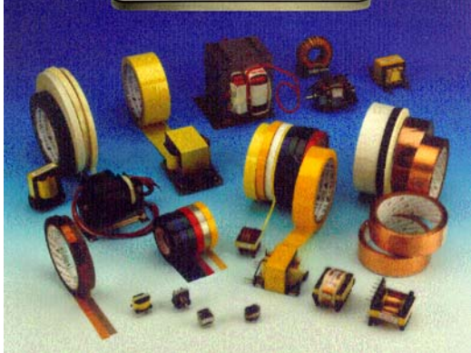
N UL FILE #E126174